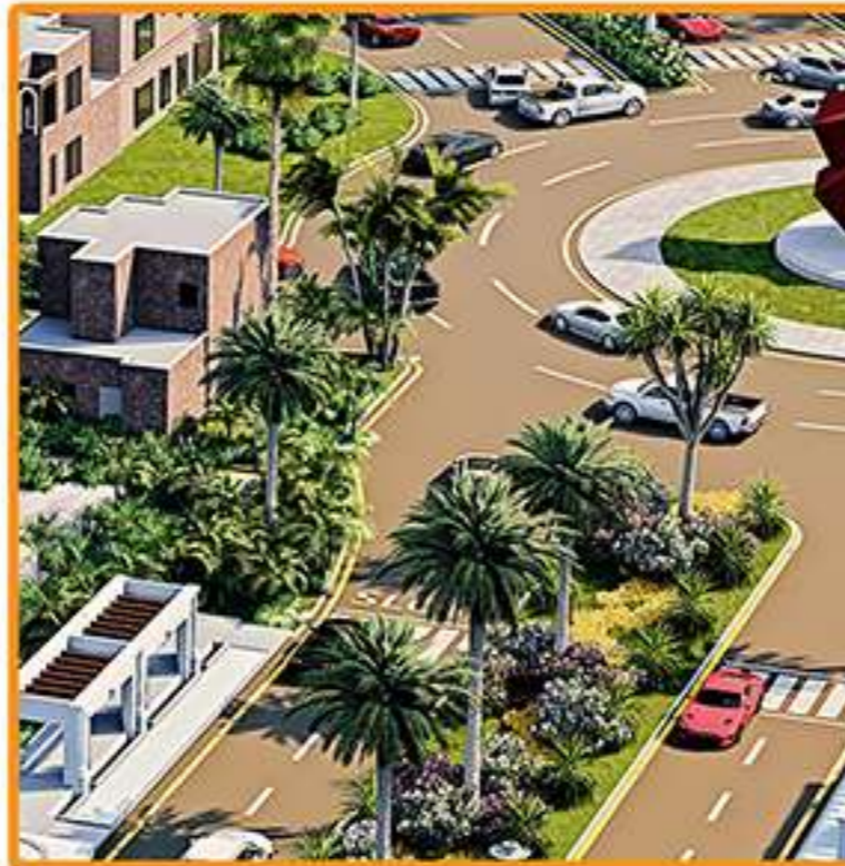
Wide Green Belted Road